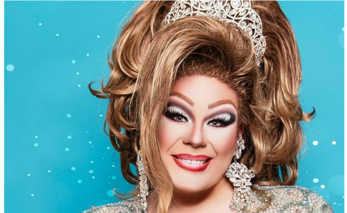
Miss Gay Arkansas USofA 2018

My oldest girl has done it 19 years now and if anything ever happened to me, she would emulate me. She's the headliner here in Hot Springs now," he said.