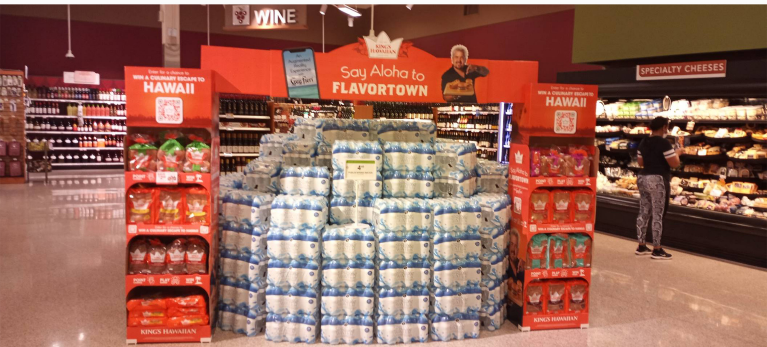
Debbie Baldwin's Display for Publix in Valrico!

Please note... Everyone 100% mask compliant (except for the 10 seconds it took to get this picture). No customers in area at that time.